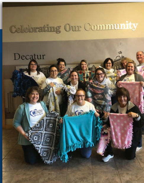
Collecting and making blankets for Blankets for Hope and the Council on Aging in Decatur.