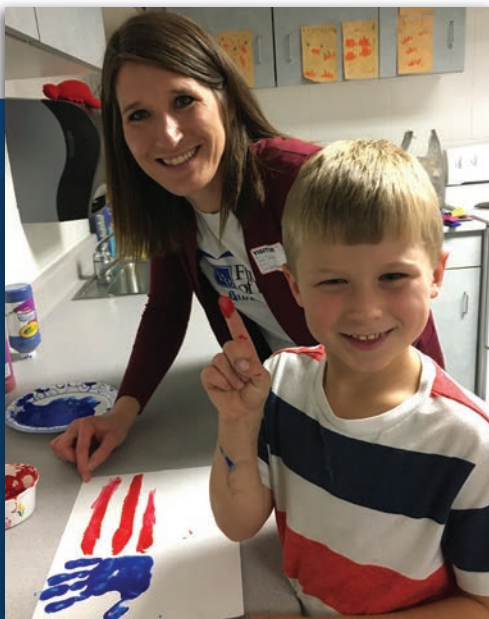
Helping the Kindergarten – 2nd grade classes at Southern Wells Elementary.

Each year our team members come together to serve the local communities in which they reside. In 2019, over 100 employees from our 8 locations donated nearly 315 hours to local organizations. From libraries and schools to food pantries and churches, our employees had the opportunity to serve area community members and organizations who need it most. In addition to the time our employees spent volunteering, First Bank of Berne also donated over $230,000 across our local communities in support of other various projects and developments.