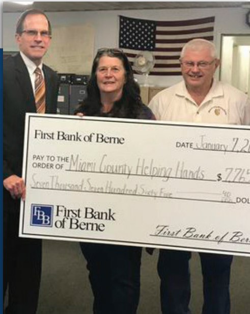
First Bank of Berne's Peru office and customers made a donation to the Miami County Helping Hands.