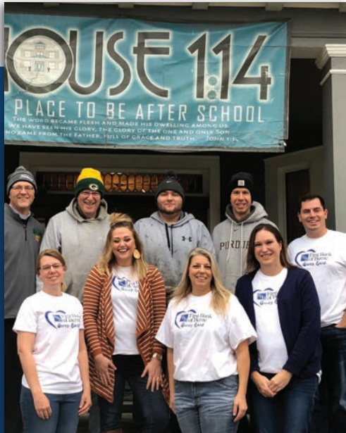
Yard work and preparing meals & snacks for House 114 in Monroe.