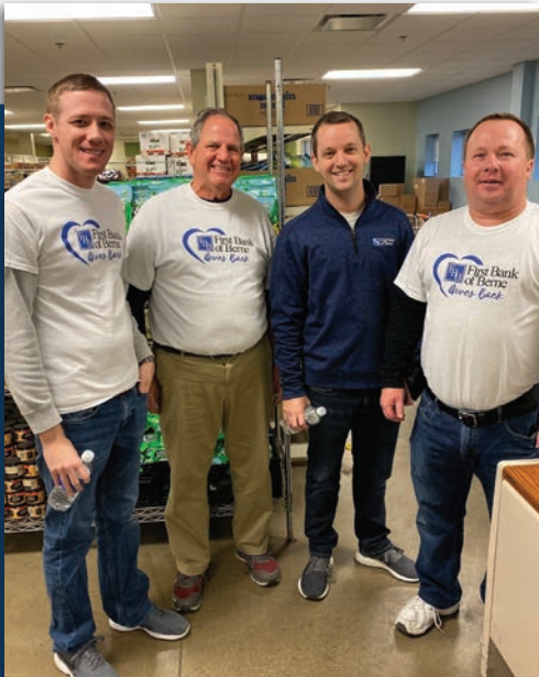
Cleaning and organization at the Community Harvest Food Bank in Fort Wayne.